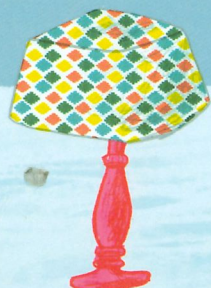
A dhaka topi (da-ka toe-pee) hat from Nepal