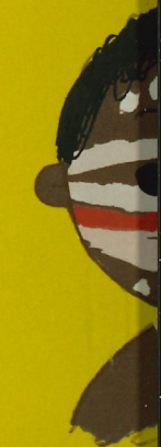
A child of the Mursi people, who live in Ethiopia