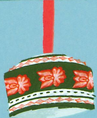
A kofia hat from Kenya