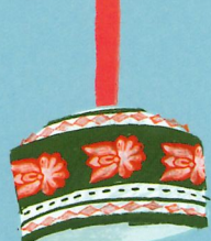
A kofia hat from Kenya