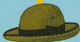
A bowler hat from Bolivia