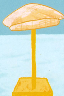
A pakol hat from Afghanistan