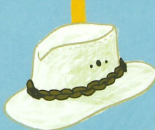
A bush hat from Australia