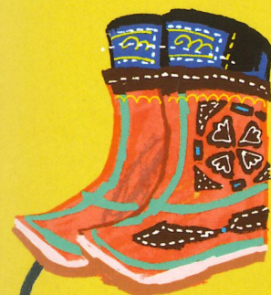
Mongolian gutul (goo-tal) boots