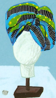
A head wrap from Africa (there are lots of different ways to tie it)