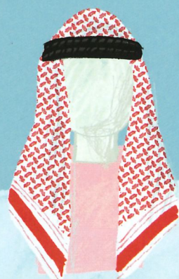
A keffiyeh (kef-ee-ya) scarf worn in the Middle East