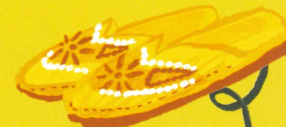
Moroccan babouche (bab-ooch) shoes