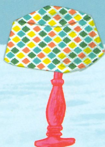
A dhaka topi (da-ka toe-pee) hat from Nepal