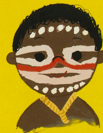
A child of the Sepik people, who live in Papua New Guinea