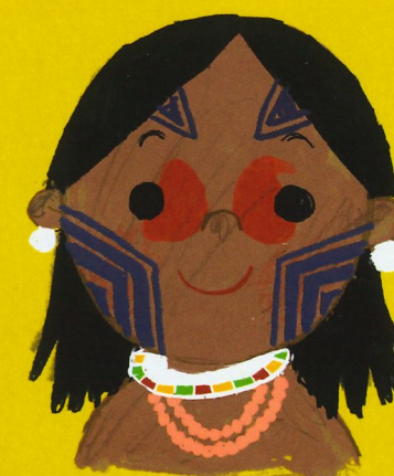
A child of the Kayapo people, who live in Brazil

Some children live in communities where people decorate their skin, especially on their faces. Here are three different styles.