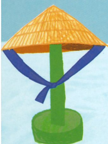
A Vietnamese nón lá straw hat