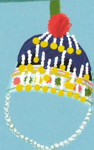
A beaded hat worn by Hmong (mong) women in Thailand