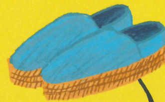
Spanish espadrille (ess-pah-dree-yeh) sandals