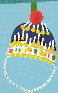
A beaded hat worn by Hmong (mong) women in Thailand