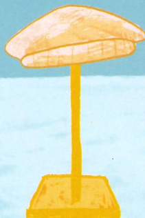
A pakol hat from Afghanistan