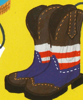
US cowboy boots