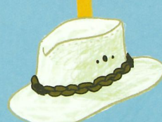
A bush hat from Australia