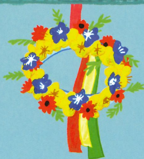
A Ukrainian flower crown called a vinok (vee-nok)