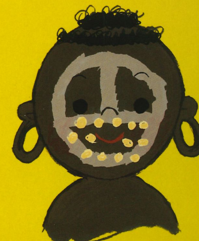
A child of the Omo people, who live in Ethiopia