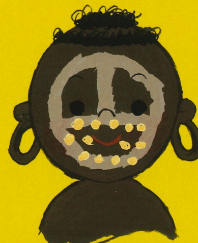
A child of the Omo people, who live in Ethiopia