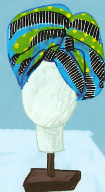
A head wrap from Africa (there are lots of different ways to tie it)