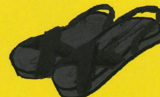
Peruvian hojotas (oh-ho-ta), made from recycled tyres