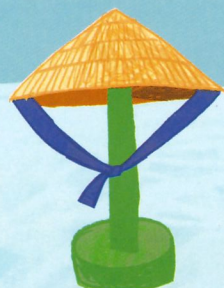
A Vietnamese nón lá straw hat